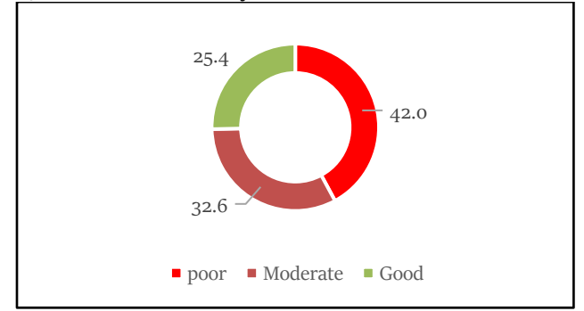
Figure (3): The study population intentions towards COVID-19 vaccination

35.6% for "When I had COVID-19, people thought badly of me"; 27.8% for "If I had COVID-19, I would be embarrassed"; 26.8% for "When I had COVID-19, I was embarrassed"; 17.0% for "When I had COVID-19, I did not tell anyone"; and 12.3% for "If I had COVID-19, I would not tell anyone".